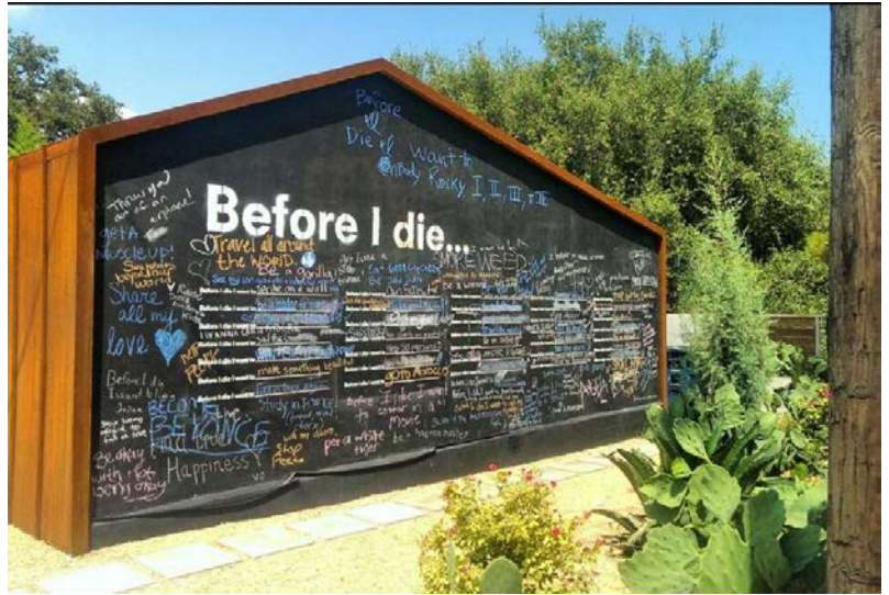
The Before I die wall at 206 Elizabeth Street (a quick and easy walk-from our upcoming LLI class)