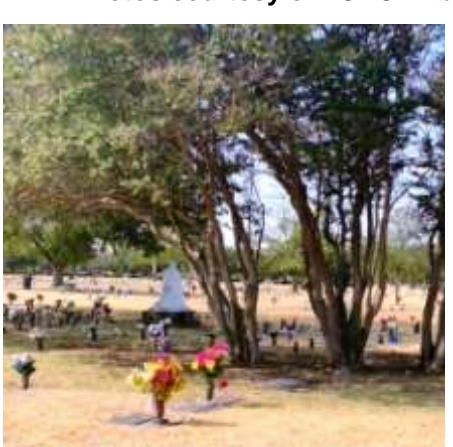
Plots in Section 90-C, 90-D, and 192-D all have views of Garden of Gethsemane statuary.