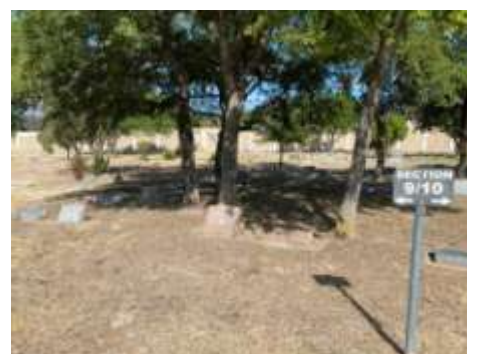
Look for Section 9/10 marker.