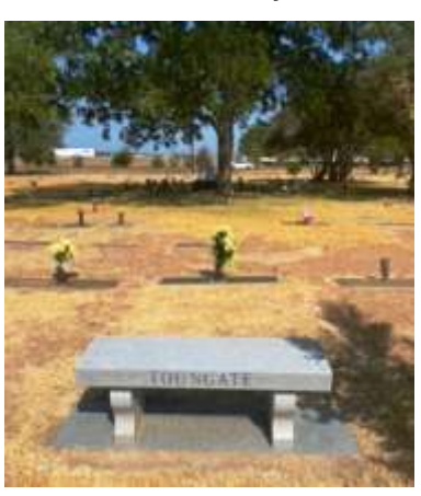
Look for Toungate Bench, which has Block 192-D plots behind it.

Cook-Walden is currently selling adult plots in Section H for $9,995 each.