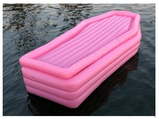
Coffin float with lid, should you want to avoid a viewing ($75 and up) www.pompomfloats.com