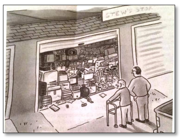
"One day, son, all of this will be yours."