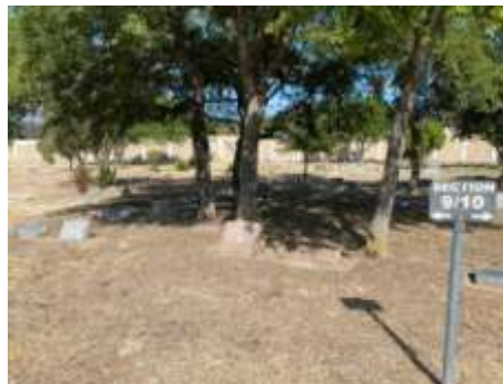
Look for Section 9/10 marker.