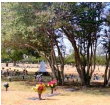
Plots in Section 90-C, 90-D, and 192-D all have views of Garden of Gethsemane statuary.

Ask cemetery staff to show you exact plot locations.