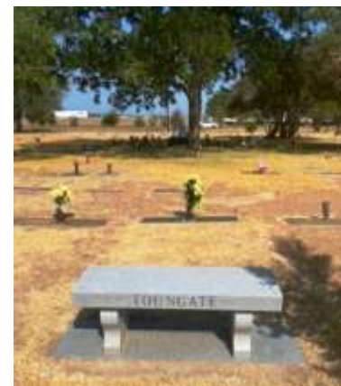
Look for Toungate Bench, which has Block 192-D plots behind it.

Cook-Walden is currently selling adult plots in Section H for $9,995 each. FCA is offering each donated plot for $5,000 . (Interest-free monthly payments can be arranged.) During the deed transfer process at the Cook-Walden Cemetery Office, buyer will pay Cook-Walden's $395 transfer fee for each transaction . (One transaction may include a single plot or multiple plots.)