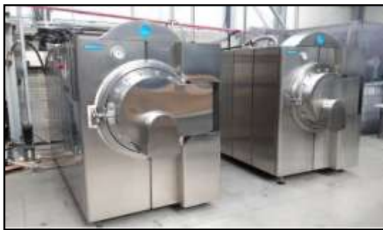
Alkaline Hydrolysis chambers, also called Resomators .

Alkaline Hydrolysis was also the disposition method of choice for Archbishop Desmond Tutu, who died on December 26, 2021.